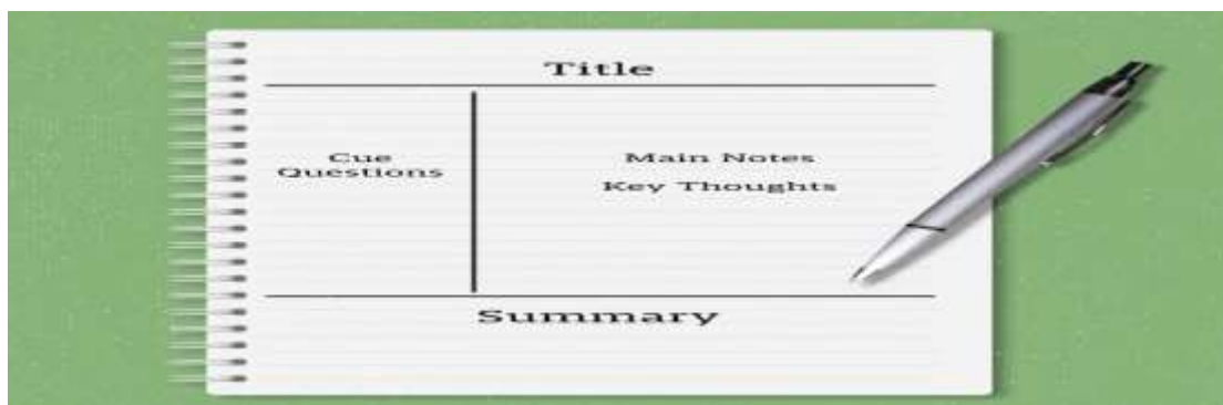
Figure (2) The Cornell method (Wilensky,2022:n.p)

Students, write down their notes and abbreviated information in the wider right-hand column and the questions prompted by the material go on the left side as shown in the figure below: